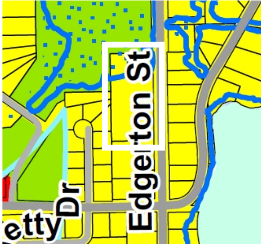
COMPREHENSIVE PLAN FUTURE LAND USE MAP (Yellow, Low Density Residential)