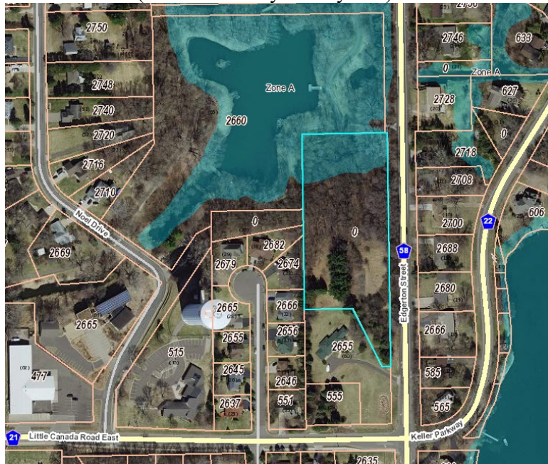
AERIAL MAP

Please see the enclosed Supplemental Information.